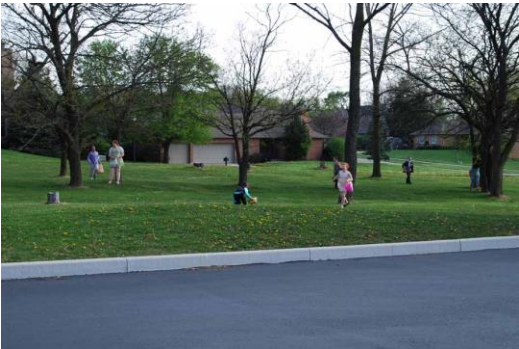
Easter Egg Hunt!