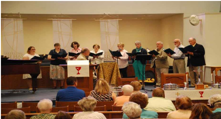
Our Wonderful Choir!