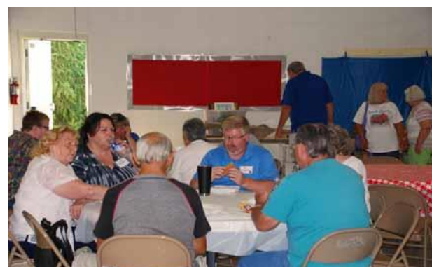
Enjoying a delicious lunch