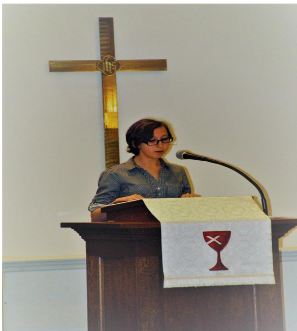
Angel reading scripture