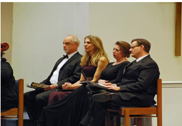
Middletown Civic Choir's Messiah performance was enjoyed by all.