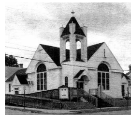
United Presbyterian Church Baltimore & Girard Streets

from Christian Missionary Society, was called to organize the new Church of Christ. Early services were held every Sunday at either the United Presbyterian Church or the Oakland Presbyterian Church, until such time as the new congregation had a place of their own to hold services.