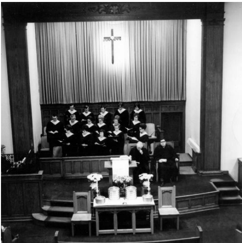
Chancel Choir 1st Ave. Circa 1950s