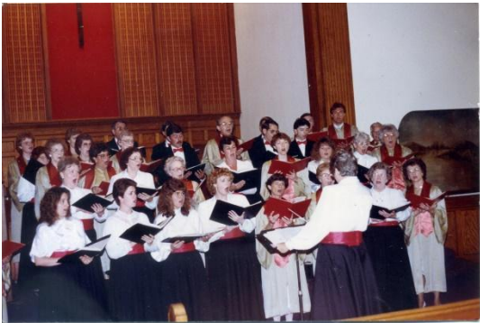
Special Music - Combined Choirs