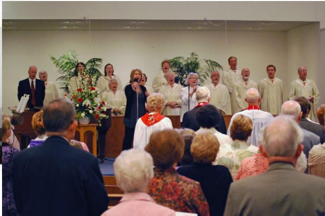
Choir - 100 Anniversary Jubilee - 2012