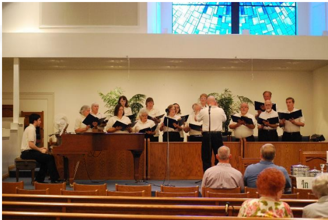
Choir- Rosedale Rd. - 2012