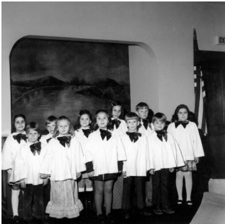
Children's Choir Circa 1960s